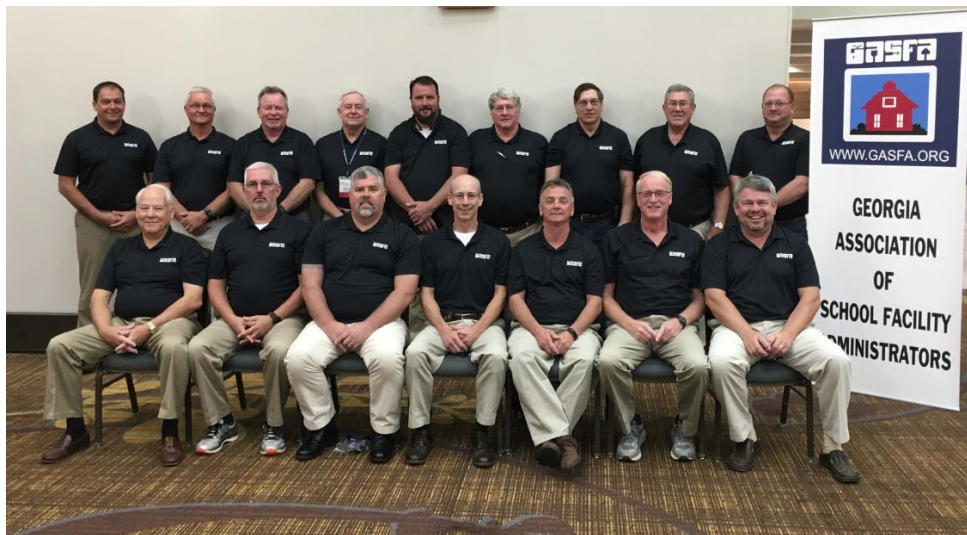
2019 GASFA Officers and Directors