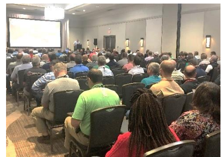
Pictures from GASFA Conference & Trade Show (see gasfa.org for more pics!)